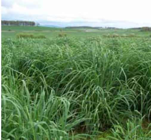
Crown Royale Orchardgrass production in Oregon